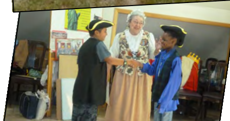
Above: 2016 Staff & Campers Left: Junior Campers

We meet at the beautiful Toah Nipi Christian Retreat Center among the birch and pine woods of Rindge, in southern New Hampshire near Mt. Monadnock.